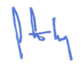
Trent Kelly Member of Congress